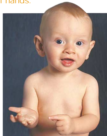
Figure 2 Learning language: a class of hand movements made by babies with profoundly deaf parents have a slower rhythm than ordinary gestures and are restricted to space in front of the body.

The low-frequency hand activity of sign-exposed babies was mainly generated within a tightly restricted space (Fig. 2), corresponding to the obligatory 'sign-phonetic' space in front of a signer's body that binds all linguistic expression in signed languages (82%); high-frequency hand activity was mainly outside this space (73%). Speech-exposed babies produced most of their high-frequency hand activity